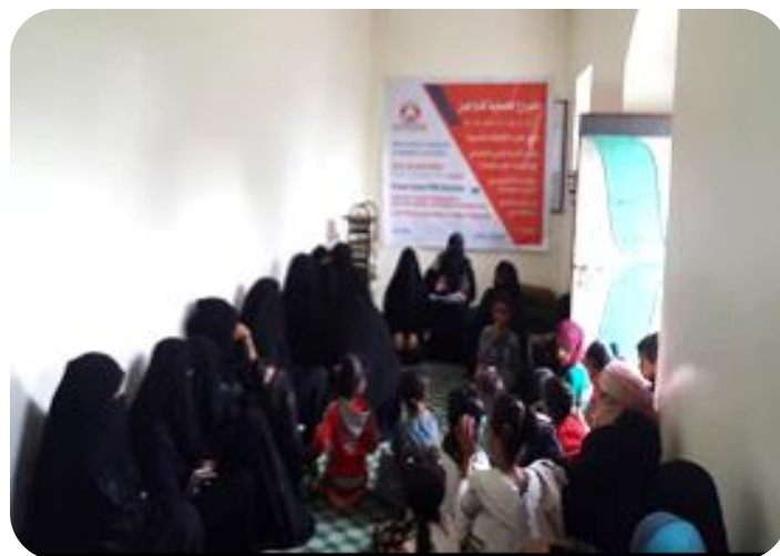
Figure 4: Educating women and children about protection violations, early marriage, and human rights.

Our protection team together with the Community Based Protection Networks (CBPNs) conducted 8 PSS sessions for 135 individuals (116 females and 19 males) in three sub-districts (Al-Asabeh, Al-Hadharim, and Adeem) of Ash Shamayatayn district.