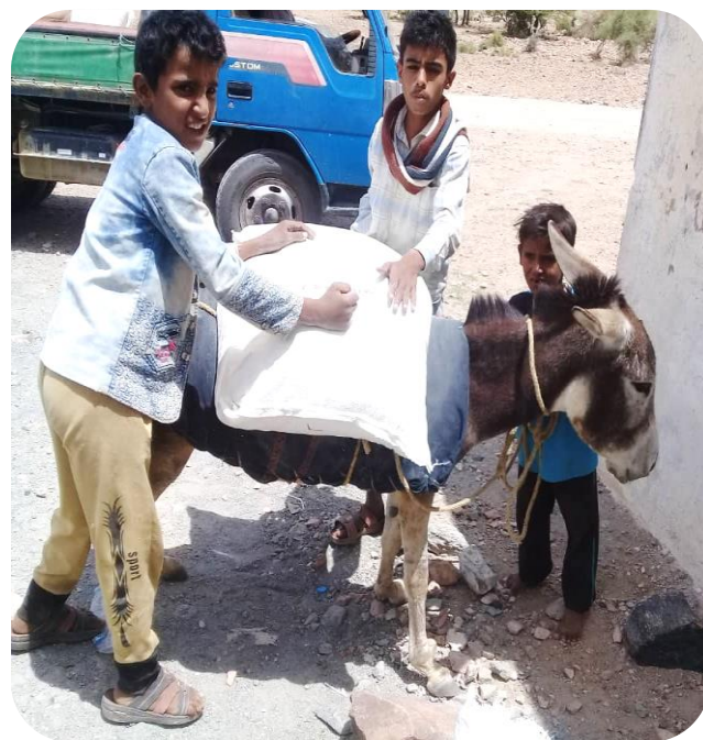
Figure 1: Distributing general food assistance to most affected populations in hard to reach areas.

Through June, a number of 700 individuals (137 men, 143 women, 203 boys, 217 girls) were provided with cash vouchers in Al-Qanawis district of Al-Hudaydah Governorate.