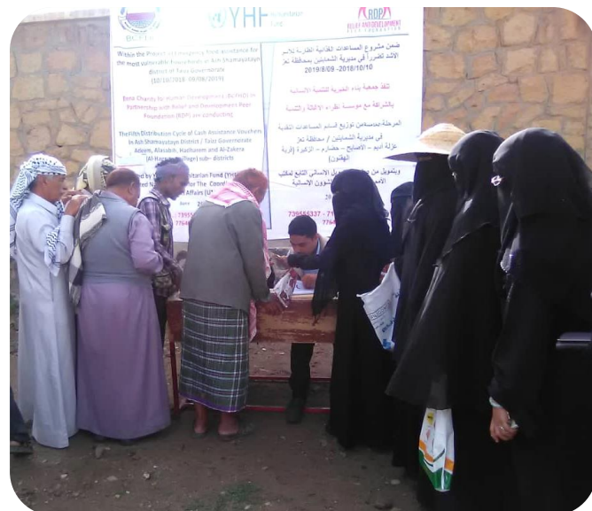
Figure 2: Fifth round of cash vouchers – cash transfer assistance – in Ash Shamayatayn district.