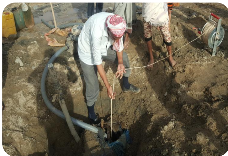
Figure 7: Measuring the depth of Al Maklowda well in Khayran Al Muharraq district.

Our consultant engineer has done water tests to measure the quality of the wells in the targeted area and to find out which one matches the high standards of being potable water.