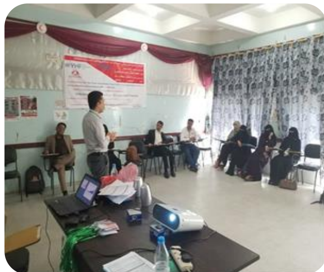
Figure 5: Training HWs on how to control cholera outbreak and manage its critical cases.

Within the Cholera Response Project, our team conducted four training workshops on infection control and case management for 80 health workers in Ibb and As Sayani districts of IBB Governorate.