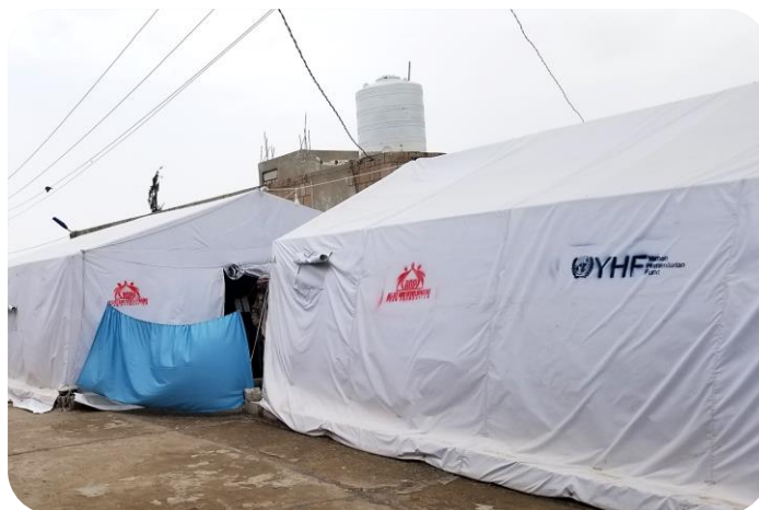
Figure 6: Reducing cholera cases and containing its outbreak through our DTCs and ORCs in Ibb and As Sayyani districts.

RDP is responding to the epidemic of cholera and reducing its transmission to prevent the loss of lives through the establishment of two diarrhea treatment centers and four oral rehydration centers in Ibb and As Sayyani districts of IBB Governorate.