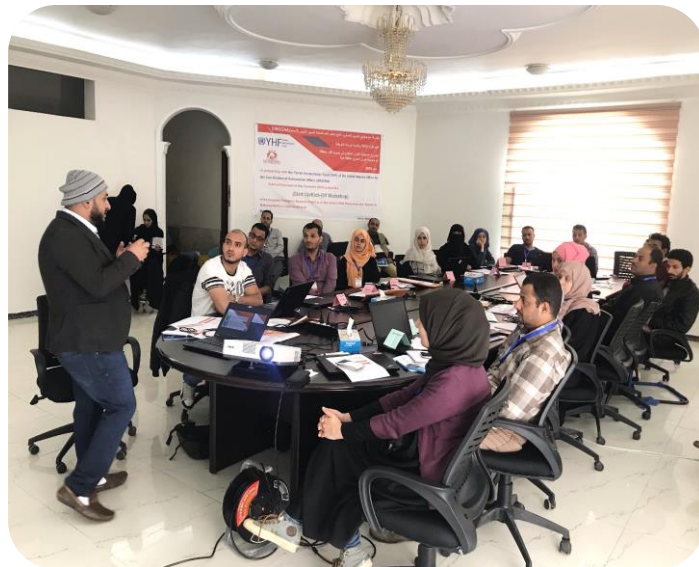
Figure 3: Discussing all project's activities in a 3-day training workshop, taking place in RDP main office.

RDP has conducted a kickoff training workshop on the “Integrated Emergency Response Project – WaSH, Livelihood and Health – in Al-Qafr district of IBB Governorate and Khiran Al-Muharraq district of Hajjah Governorate” to demonstrate its main objectives, outcomes, and detailed activities for all project members.