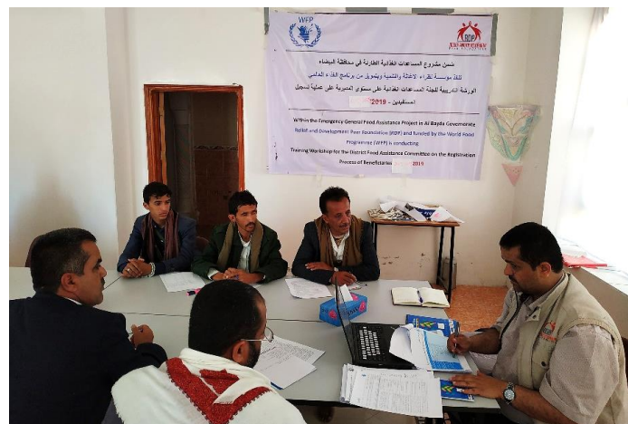
Figure 2: Training DIFACs members on the new registration process for beneficiaries and on how to select committees' members at the levels of SUFAC and EFAC.

RDP field team conducted two training workshops to discuss the new registration process for beneficiaries and the roles of DIFACs members. The trainings aimed to have the 14 DIFACs members prepared for the coming activities of formation at the levels of SUFAC and EFAC.