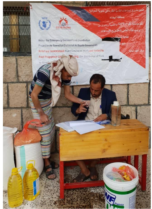
Figure 1: receiving general food assistance in Al-Bayda Governorate

A total of 7,630 HHs of 53,410 individuals disaggregated (21,364 men, 22,219 women, 4,806 boys, 5,021 girls) have received food baskets of May distribution cycle in (Wald Rabe'e, Al Malagim, As Swadyah) districts of Al-Bayda Governorate.