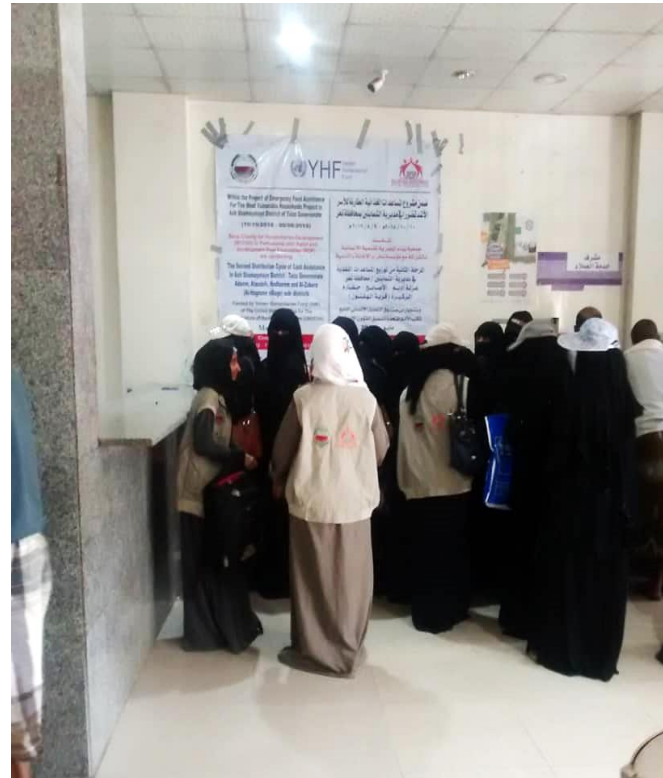
Figure 3: receiving the cash assistance from cash transfer points (Al-Kuraimi Bank).

RDP has provided a total number of 2,800 HHs of 19,600 individuals disaggregated (3,842 men, 3,998 women, 5,762 boys and 5,998 girls) with unconditional vouchers/cash transfer assistance in (Alasabeh- Alhadharim- Adeem- Alzakira (Alhaqnoon) sub-districts.