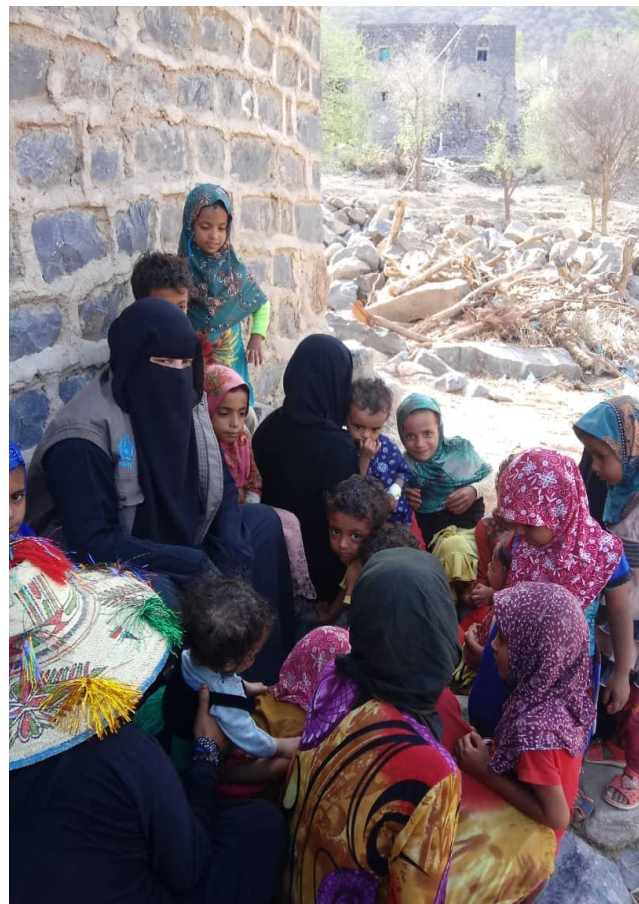
Figure 5: Conducting awareness raising sessions for the community, especially those who live in the third catchment areas.

RDP is supporting 3 health facilities (Mudahajayn, Al-Mabda, Al-Karaba) with emergency and general health services, essential equipment, operational support, minimum and initial reproductive health services, and most importantly these health facilities are being rehabilitated.