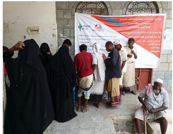
Figure 4: IDPs are queuing to receive their cash vouchers in Al-Qanawis district of Al-Hudaydah Governorate.

Through April, RDP has supported 100 most vulnerable HHs of 700 individuals (137 men, 143 women, 203 boys, 217 girls) with cash vouchers in Al-Qanawis district of Al-Hudaydah Governorate.