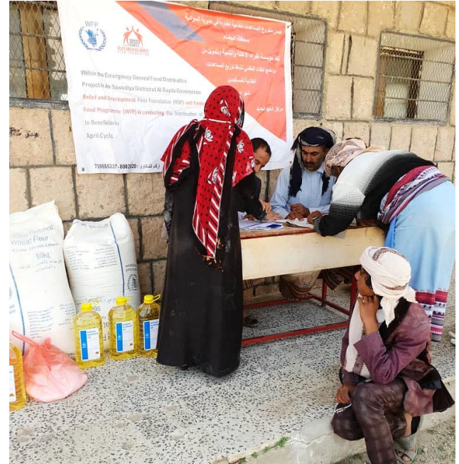
Figure 1: Taking beneficiaries' fingerprints before handing out food rations in Al-Bayda Governorate.

Our FSL field team have launched April distribution cycle of “General Food Assistance for the most Vulnerable Households” in (Wald Rabe'e, Al Malagim, As Swadyah) districts of Al-Bayda Governorate, benefitting 7,630 HHs of 53,410 individuals disaggregated (21,364 men, 22,219 women, 4,806 boys, 5,021 girls).