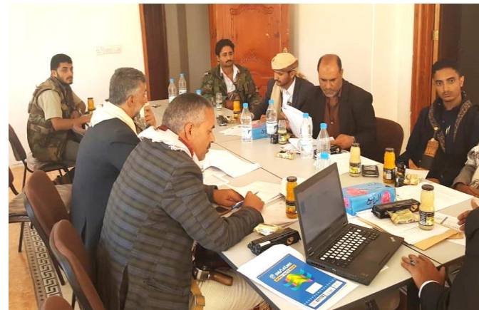
Figure 2: Training DIFAC members on the new registration process for beneficiaries and on how to select committees' members at the levels of SUFAC and EFAC.

RDP field team conducted a training workshop to discuss the new registration process for beneficiaries and the roles of DIFAC members. The training aimed to have the 7 DIFAC members prepared for the coming activities of formation at the levels of SUFAC and EFAC.