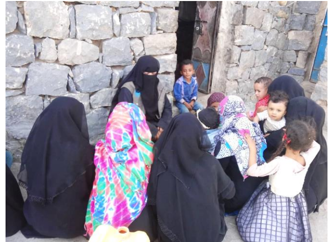
Figure 3: Conducting awareness raising sessions for the community, especially those who live in the third catchment areas.

To raise awareness on important health, nutrition, hygiene, and Infant Young Child Feeding (IYCF) key messages, our 283 CNVs have launched over 861 awareness-raising campaigns for people in the second and third tiers around the supported 52 health facilities in Fara Al-Udayn, Hazm Al-Udayn, Mudhiakhera and Al-Udayn districts, achieving a total number of 14,612 individuals disaggregated (3,184 men, 11,428 women).