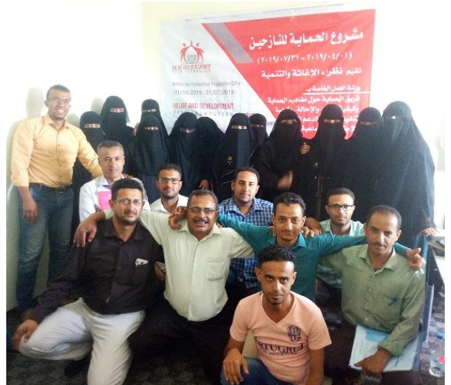
Figure 1: Protection team are taking a training workshop on how to lead PSS sessions effectively and in accordance with protection standards.

During the reporting period, RDP managed to train 20 community-based protection volunteers on the protection standards and responsibilities to enhance their knowledge of Psycho Social Support (PSS) and how to give a referral for such cases. The training also helped volunteers know how to effectively lead PSS sessions in the targeted sub-districts (Al-Asabeh – Adeem – Hadharim) of Ash Shamayatayn district of Taizz Governorate.