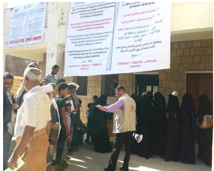
Figure 3: Vulnerable HHs are lining up to get their cash vouchers in Ash Shamayatayn district, Taizz Governorate.

Our FSL team launched the third distribution cycle of unconditional vouchers/cash transfer assistance in four sub-districts (Alasabeh- Alhadharim- Adeem- Alzakira (Alhaqnoon) of Ash Shamayatayn district, benefitting a total number of 2,800 HHs of 19,600 individuals disaggregated (3,842 men, 3,998 women, 5,762 boys and 5,998 girls).