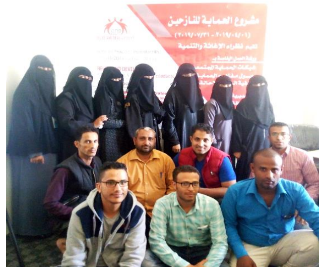
Figure 2: Training CBPNs on how to sensitize the community in the importance of protection activities in Ash Shamayatayn district of Taizz Gov.

RDP conducted a training workshop for 12 individuals of Community-based Protection Networks (CBPNs), aiming to build their capacity on the protection criteria, train them on how to sensitize the community in the importance of protection activities, and provide them with guidelines on how to carry out Psycho Social Support sessions (PSS).