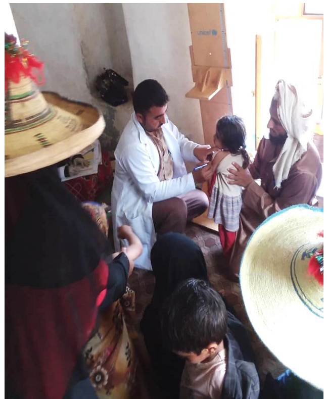
Figure 1: Screening children under 5 to identify malnutrition and serving them with TSFP services.

During the reporting period, RDP nutrition teams have distributed 204.638 Metric tons of Super Cereal plus for 34,097 Pregnant Lactating Women (PLW) and 36.45 Metric Tons of Plumpy'Doz for 24,230 children under 2 in approximately 104 Food Distribution Points (FDPs) over four Districts of Ibb Governorate.