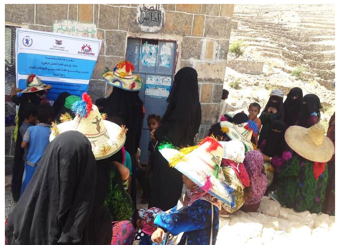
Figure 2: Serving children under 2 and pregnant & lactating women with BSFP services (Plumpy doz and Soya (WSB+) in hard to reach areas.