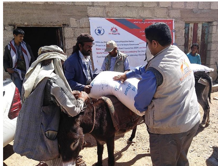
Figure 4: Launching October distribution cycle of the General Food Assistance (GFA) project in 3 districts of Al-Bayda Governorate.

Within the general food assistance project funded by WFP, RDP FSL field team launched October distribution cycle of the General Food Assistance (GFA) project, reaching a total number of 53,410 individuals disaggregated (10,468 men, 10,896 women, 15,703 boys, 16,343 girls) in 3 districts (Wald Rabi, Al Malagim, and As Sawadiya) of Al-Bayda Governorate.