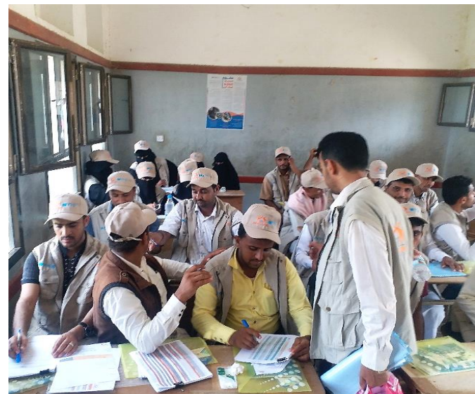
Figure 6: Training 20 enumerators on beneficiaries' registration and verification processes in Khayran Al-Muharraq district, Hajjah Governorate.