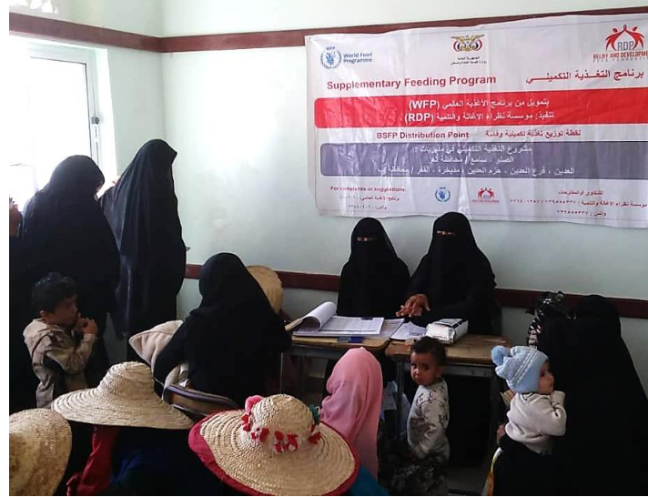
Figure 3: Reaching 58,904 individuals through awareness-raising campaigns in seven districts of IBB and Taizz Governorates.

3,900 awareness sessions on exclusive breastfeeding, hands washing, the importance of routine vaccinations, advantages of using bathrooms, diseases outbreaks, safe motherhood, pregnant care, medical follow-up in pregnancy, dangerous signs of pregnancy, family planning, signs of malnutrition, balanced food, and others were conducted by our 708 Community Nutrition Volunteers (CNVs), reaching a total number of 58,904 individuals in 7 districts (Far Al Udayn, Al Udayn, Hazm Al Udayn, Mudhaikhera, Al Qafr, Same, As Silw) of IBB and Taizz Governorates.