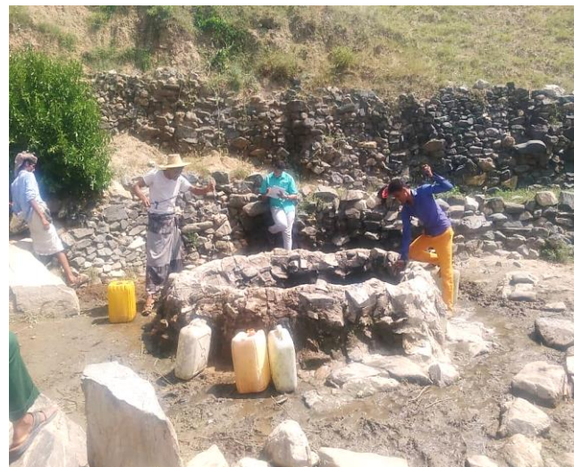
Figure 10: Conducting a WASH needs assessment to determine the current situation of WASH sector in Al Hazm district of Al Jawf Governorate.