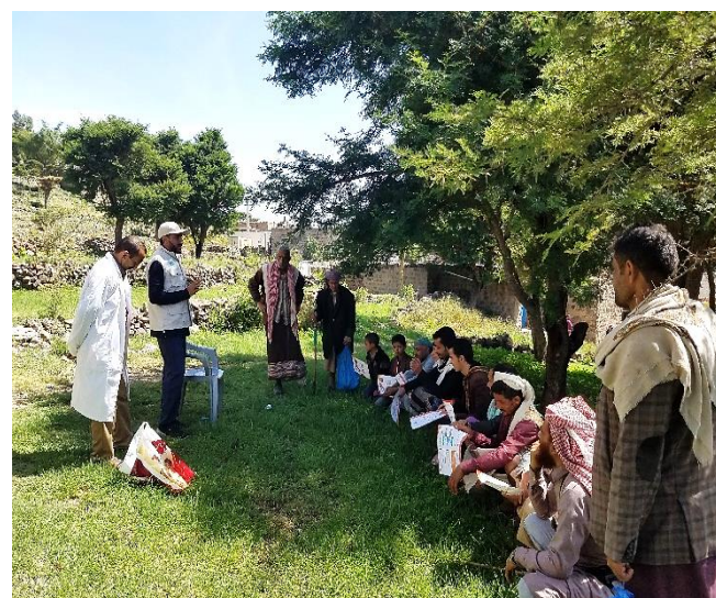
Figure 11: Delivering crucial hygiene key messages for 2,232 of population over four governorates.