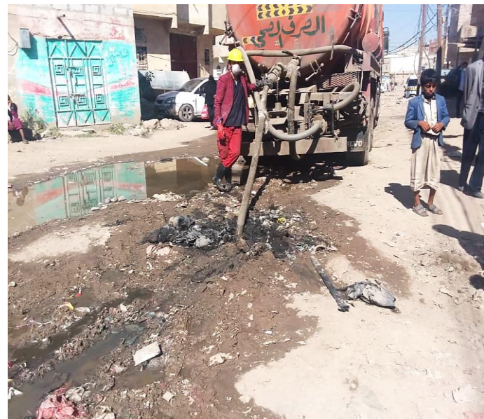
Figure 8: Emptying the overflowing cesspits in Hamra'a Alib area in As Sabain district of Amanat Al-Asimah Governorate.

The desludging activity continues for 229 out of 320 cesspits to serve a total number of 5,546 individuals in Hamra'a Alib area in As Sabain district of Amanat Al-Asimah Governorate. This is to contribute in mitigation cholera outbreaks in Hamra'a Alib area in As Sabain district which is one of the high risk areas with reported cholera cases.