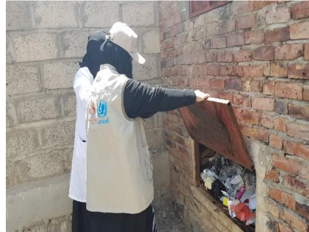
Figure 9: Assessing WASH services in 124 health facilities over four governorates.

Our WASH field teams have conducted 124 hygiene awareness sessions to help improve families' health and prevent further diseases outbreaks in 124 health facilities, reaching a total number of 2,232 individuals over four governorates (Marib, Al-Bayda, Amran, Dhamar). They delivered many hygiene messages to raise awareness about the importance of WASH and how to practice it through daily life.