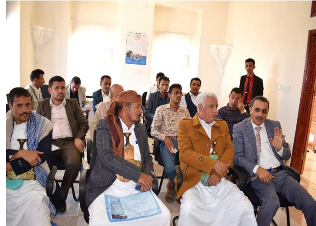
Figure 5: Discussing all project activities with community stakeholders and local authorities in Hajjah Governorate.

A total number of 20 enumerators of the registration and verification teams had an intensive training workshop on the registration and verification processes of beneficiaries that took place in Khayran Al-Muharraq district, Hajjah Governorate. The major objective of the workshop was to ensure the complete understanding on how to select the most vulnerable households based on the vulnerability selection criteria which are endorsed by FSAC.