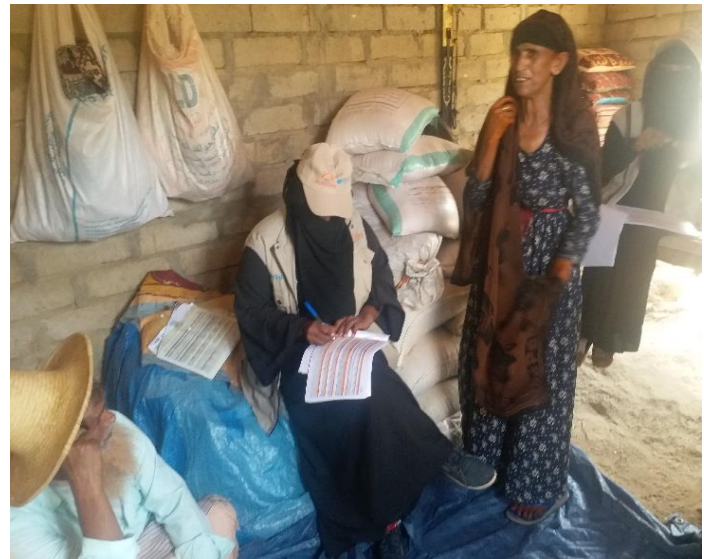
Figure 7: RDP field enumerators began the registration process in 22 villages of Gharbi Alkhamysayn sub-district, Khayran Al-Muharraq district of Hajjah Governorate.

RDP trained field enumerators began the registration process by getting the initial lists of beneficiaries provided by the Food Management Committees (FMCs). Our registration team visited 22 villages of Gharbi Alkhamysayn sub-district, met the beneficiaries in their homes and registered a number of 558 households. The registration process will be completed by November when registering 100 households of children (6-59 months) with Severe Acute Malnutrition (SAM) cases and 102 other households nominated by the FMCs to reach a total of 750 HH.