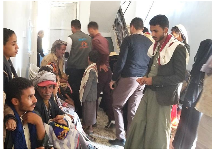
Figure 1: A total of 2,918 individuals have received wide-ranging health care through our health facilities in Al-Qafr district of IBB Governorate.

Only in Al-Qafr district are there countless number of vulnerable people who are desperately in need of health care services regardless of any other assistance. Thus, RDP-supported 3 health facilities (Madahajayn, Al-Mabda, Al-Karaba) have served 85 reproductive health cases as (79 ANC, 3 ND, 3 PNC), treated 49 suspected cholera cases, vaccinated 50 children, given medical consultations to 1,499 individuals (316 men, 573 women, 298 boys, 312 girls), reached 1,235 individuals through 82 awareness – raising campaigns.