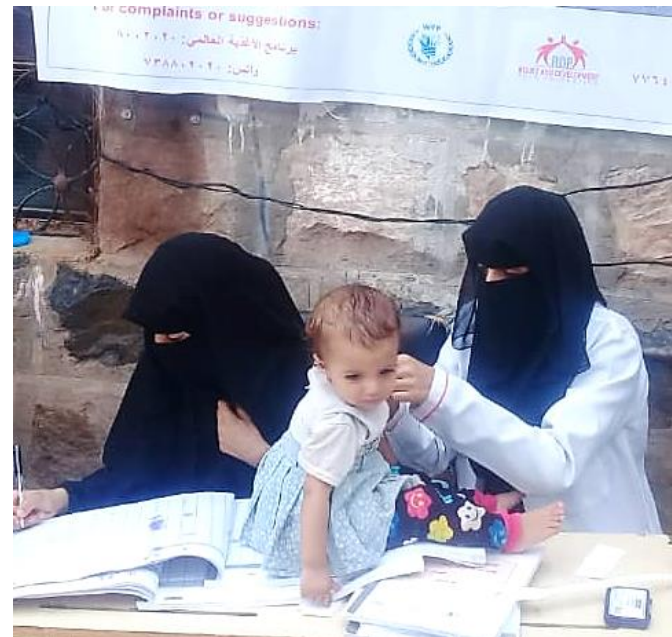
Figure 2: Providing 96,394 children U2 and PLW with BSFP services over seven districts of IBB and Taizz Governorates.

708 of RDP’s Community Nutrition Volunteers (CNVs) have distributed a tremendous amount of nutrition commodities through 236 food distribution points (FDPs) throughout October. A number of 45,930 children under 2 have received over 68 MTs of Plumpy Doz while an achieved total number of 50,464 PLW were provided with more than 300 MTs of WSB+ (soya), targeting 7 districts (Far Al-Udayn, Al-Udayn , Hazm Al-Udayn, Mudhaikhera, Al Qafr, Same, As Silw) of IBB and Taizz Governorates